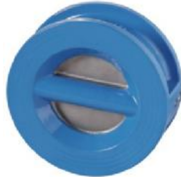
Fig No. :CHV404-PN16 CHV404-PN25 CHV404-125