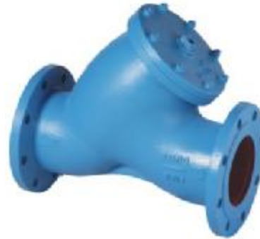
Fig No. :STR801-PN25

NOTE: 1.DN50~DN300 meshes \Phi 1.5 DN350~DN600 meshes \Phi 3.0 2.It can be manufactured according to customer's requirement 3.DN450~DN600 Body and bonnet's materials are EN-GJS-450-10